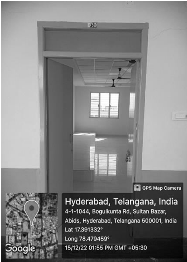
Class Room No: E-509